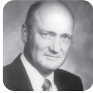
LINUS SOLBERG CYLINDER