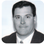
TRENT WILL SPIRIT LAKE